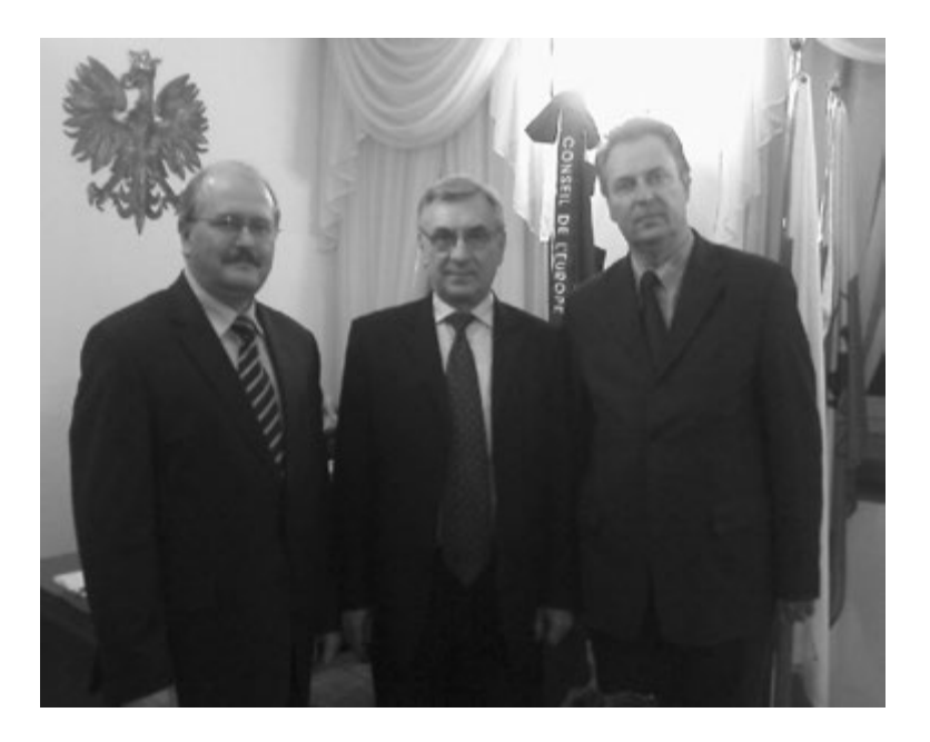
Fig. 1. The appointment of conference participants by the mayor of the city of Katowice Piotr Uszok Rys. 1. Przyjęcie uczestników konferencji prezydentem miasta Katowice Piotrem Uszokem

Before the conference the mayor of the city of Katowice Piotr Uszok received some of the participants. In particular, in conversation with the rector of the East Ukrainian National University of prof. Alexander Golubenko (fig. 1) importance of development of inter-regional contacts in the field of transport has been noted.